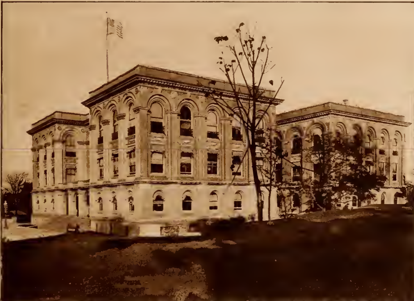
MUNICIPAL BUILDING, Borough of Bronx.